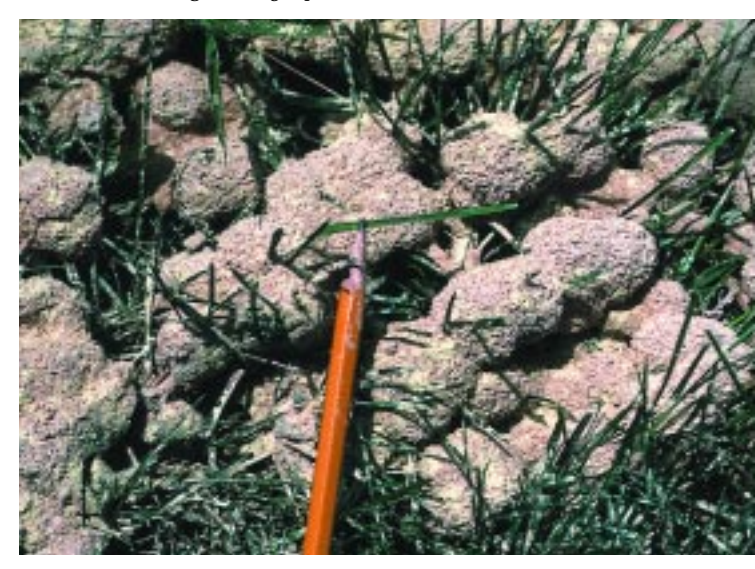
Figure 15 A slime mold fungus ( Fuligo sp.).

trees and dead limbs. These familiar, large, and black ants do not nest in wood chips. They may forage for food, such as dead insects, in mulch but they do not live there. Carpenter ants are best controlled by locating and treating their nest. Consult an expert.