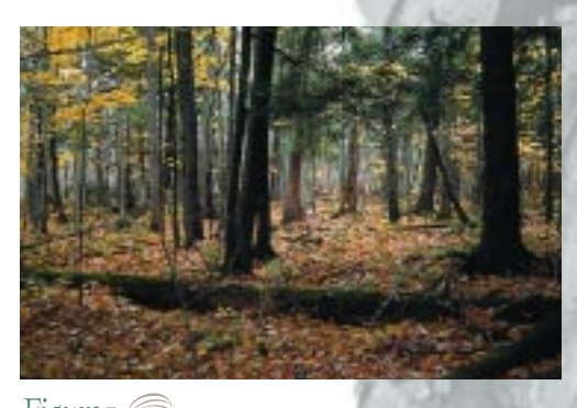
Figure 1 States of the ground is covered with a layer of decaying organic matter. Many landscape trees evolved in forest environments.

he use of mulch in managed landscapes is increasing rapidly. Mulches are commonly used to enhance the beauty of landscapes, suppress weeds, conserve soil moisture, and buffer plants from the damaging effects of traffic and lawn equipment. Organic mulches also can improve the soil structure and increase the fertility of landscape soils, which often are compacted and lacking in organic matter, especially around newly constructed buildings. Many woody landscape plants evolved in forests where the soil is typically covered by a moist layer of decaying leaves, twigs, and branches (Figure 1). Mulching trees and shrubs can recreate some aspects of a forest's soil environment, even in sun-baked landscapes far from any forest.