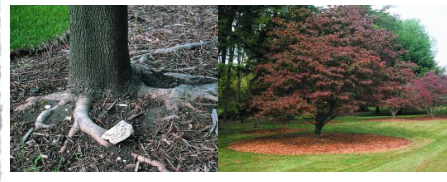
Figure 6 A mulched zone extends slightly beyond the drip zone of this dogwood.

A mulched zone around trees protects against mechanical injury to tree roots growing on the surface of the ground, especially for shallow-rooting species, such as silver maple and Norway maple (Figure 5). A frequent recommendation is to buffer trees and shrubs with a mulched zone that extends from near the trunk to the drip line (the area under the tree directly below the canopy) (Figure 6). Another advantage of isolating trees from turf is prevention of mower blight (mower collisions that damage the bark, cambium, and vascular tissue of trees) (Figure 7). Mechanical damage to the trunk frequently reduces the vigor and life span of landscape trees by disrupting water and nutrient translocation and by creating entry points for plant pathogens and decay-causing fungi.