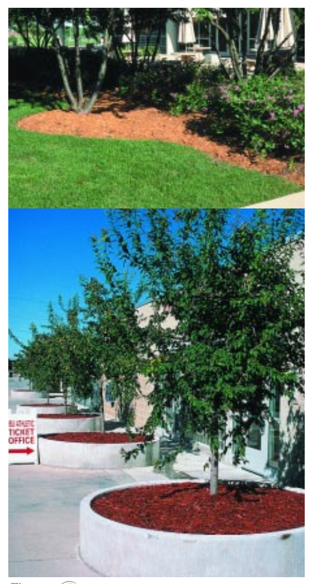
Figure 3 Wood chips in these raised planters have been dyed to enhance their ornamental value.

Figure 2 Mulched trees and shrubs in a managed landscape.