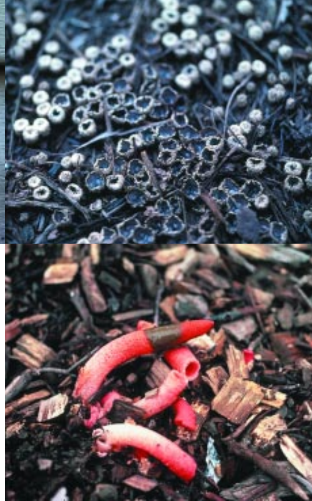
Figure 14 A stinkhorn fungus (Mutinus elegans).

A recent Ohio State University Fact Sheet (available on OhioLine at http://www.ag.ohiostate.edu/~ohioline/hyg-fact/3000/3304.html) provides details on managing nuisance fungi in mulch. Management strategies are preventive in nature. Dry mulches (moisture content less than 34 percent) that are high in wood content cause most problems since fungi are the primary colonizers of dry wood. Moisture levels greater than 40 percent foster the growth of bacteria, which compete with nuisance fungi, reducing their potential to cause problems. However, sour mulches (discussed previously) also can generate problems since bacteria cannot survive when the pH is lower than 5.2. Most problems with nuisance fungi can be avoided by composting woody mulch before use, thoroughly soaking mulches after they have been applied, and avoiding sour mulches.